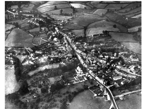
Aerial view of Chudleigh - 1948